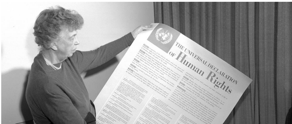
Mrs. Eleanor Roosevelt of the United States, chair of the drafting committee, holding a Universal Declaration of Human Rights poster in English. UN Photo (1949)

This day marks the beginning of a year-long celebration of the UN Universal Declaration of Human Rights on December 10, 1948, culminating in the 70 th anniversary in 2018. This document proclaimed the inalienable rights which everyone is inherently entitled to as a human being. It establishes the equal dignity and worth of every person as the foundation for a more just world. This declaration enshrined the values of equality, justice and human dignity as